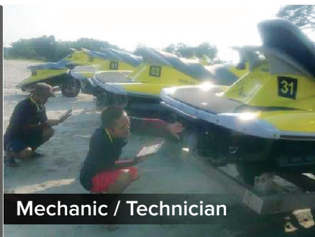
Mechanic / Technician